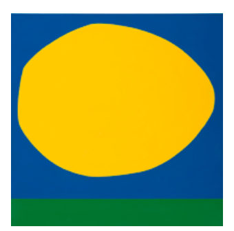
Ellsworth Kelly, High Yellow