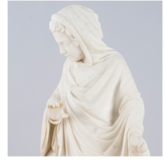
Randolph Rogers, The Truant

SEL Competencies: Self-management; Responsible decision-making